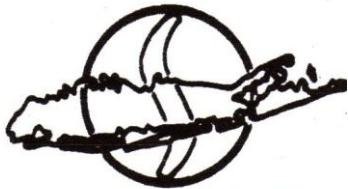
OFFICIAL PUBLICATION OF THE LONG ISLAND CHAPTER, SDC

NOTE: YOU MUST BE A MEMBER OF THE SDC TO JOIN A LOCAL CHAPTER.